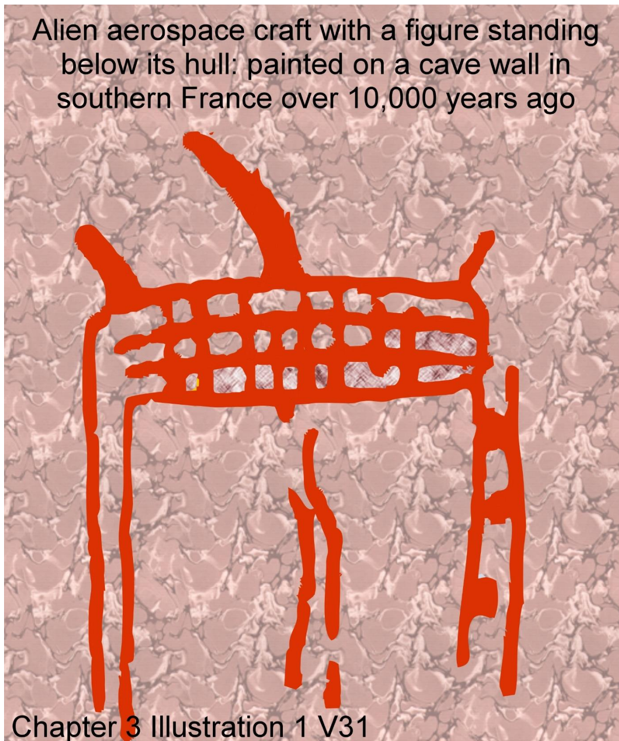
Illustration 1 (below) is an impression of a prehistoric cave painting or pictograph that may have depicted an alien aerospace craft with its landing gear extended and its descent ladder deployed, and an alien standing by or below its hull.

originally inspired by Monsieur Michel's monochrome interpretations of prehistoric art works: Palaeolithic UFO-Shapes – Mysterious drawings in the Stone Age caves of France and Spain , translated from the French language by Mr. Gordon Creighton , and published in Flying Saucer Review, November - December 1969, Vol. 15, No. 6, pages 3 – 11 .